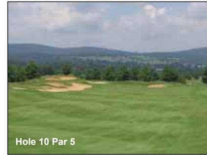
Hole 10 Par 5

4, the longest par 3, and the demanding uphill par 5 ninth raises even the best player's intensity.