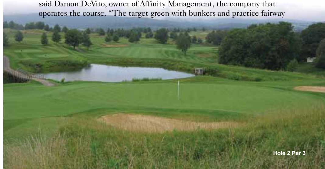
Hole 2 Par 3