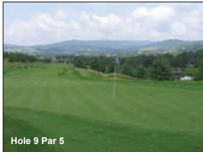
Hole 9 Par 5

Musket Ridge, located just west of Frederick in Myersville, sits just below the mountain skyline. Faint semblances of communication towers may remind you of the nearby retreat called Camp David. The tee box sits at the top of a ridge on the par 4 first hole, and the view of the Free State's countryside rivals any scenic overlook you may come across in your travels. First