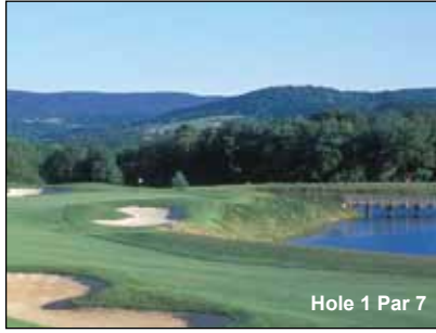
Hole 1 Par 7